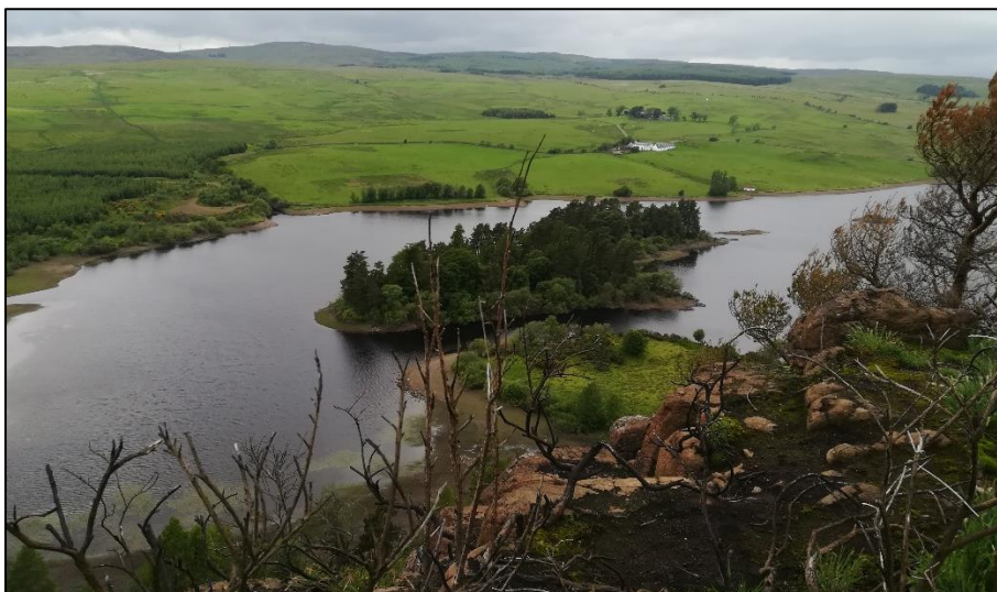
Treeless landscape and fire damage at North Third reservoir.

Our intensively managed landscape and supporting habitats are susceptible to a changing climate and insufficiently resilient to the impacts of more volatile and extreme weather.