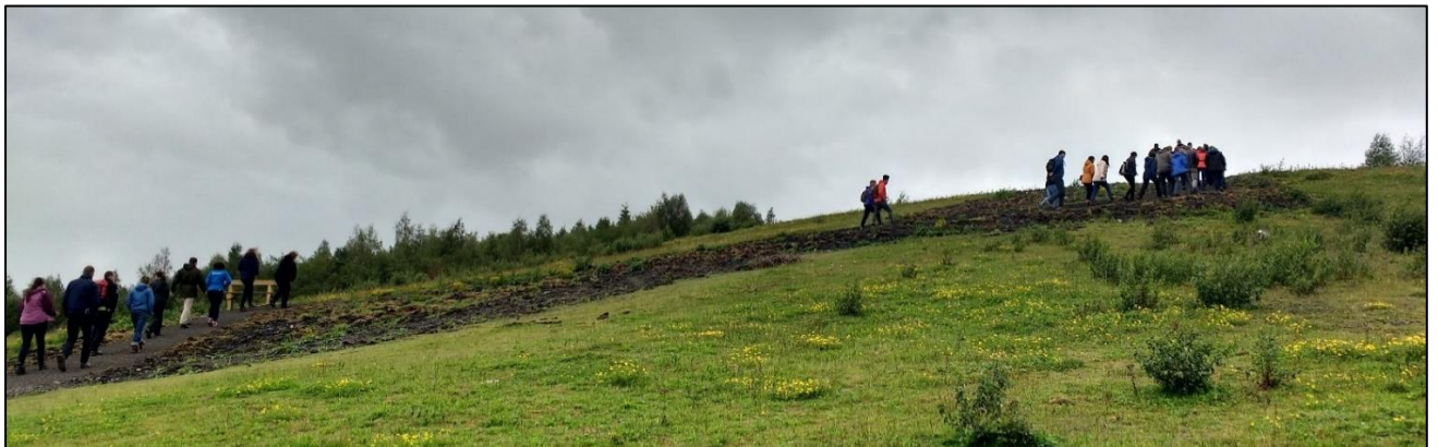
Improved path at Fallin Bing installed as part of the Inner Forth Landscape Initiative

Research shows that a healthy natural environment has positive impacts on our health and wellbeing. Recognition of these benefits of healthy green spaces provides the opportunity to create more natural, healthy green spaces within our settlements, from small pocket parks to larger urban parks, and to reconnect our residents with nature.