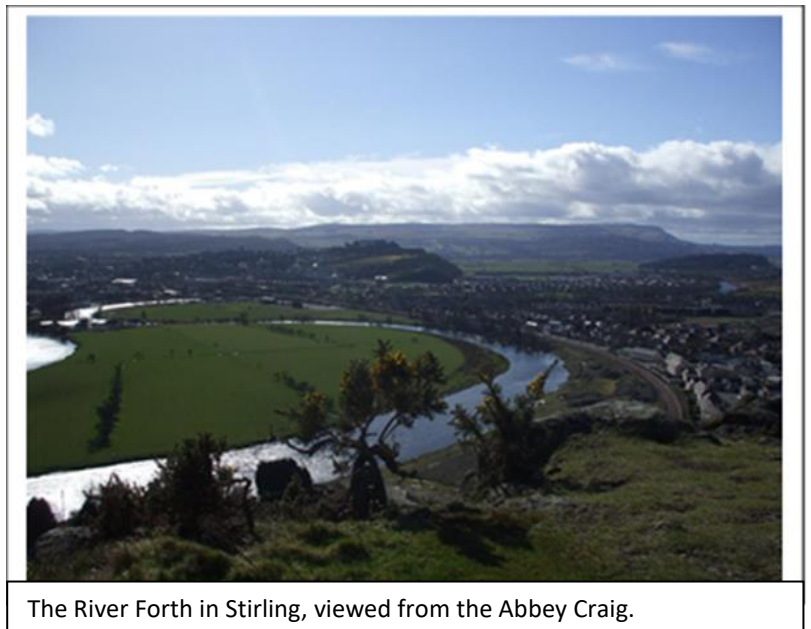
The River Forth in Stirling, viewed from the Abbey Craig.

Action is needed now to halt and reverse these impacts. While there are many challenges to overcome, there are also many benefits to be secured through investing resources to ensure a healthy and vibrant natural environment.