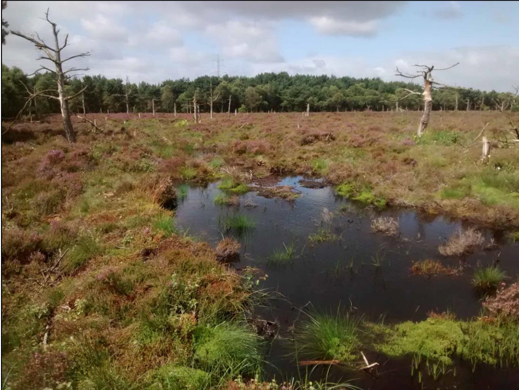
Lowland raised bog at Wester Moss, Fallin. Restored by Butterfly Conservation Scotland and volunteers

This is as vital for the Stirling area as it is for the country and the rest of the world.